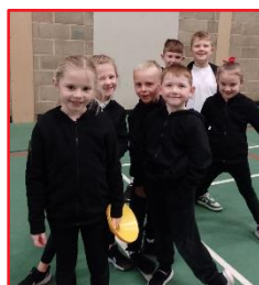
Some photos from Year2's football festival.