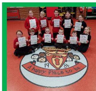
Well done Eco Council for taking part in the Great British Bird Watch

Cleveland Police are holding a webinar for parents on how to keep children safe online. See the poster below for details.