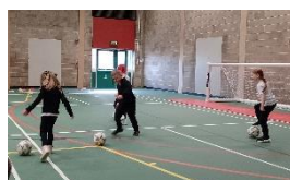
Action from the Year 1 Football Festival